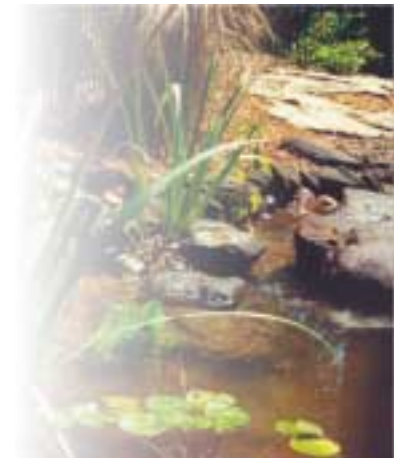
fig. 4.1 The Anatomy of a Natural Swimming Pool (part 2)